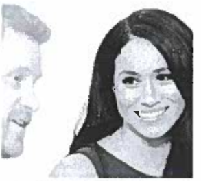
GAINING SUPPORT: Prince Harry, Duke of Sussex and Meghan, Duchess of Sussex attend the WellChild awards pre-Ceremony reception at Royal Lancaster Hotel on Oct. 15 in London, England.

Markle has some impressive new support in her quest for fair treatment by the media: 72 female members of Britain's Parliament.